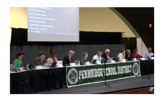
Pennridge passed Policy 720, which separated bathrooms on the basis on sex, in an 8 to 1 vote in April