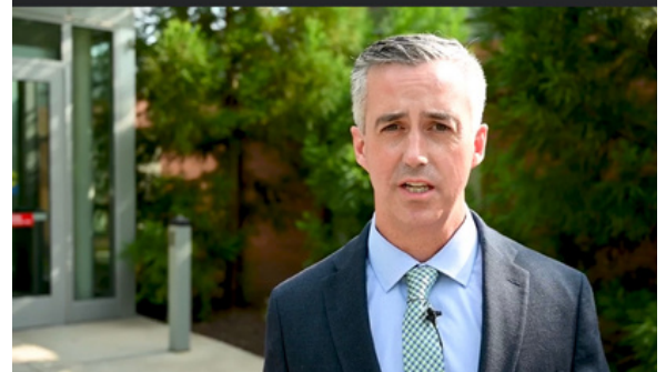
Commissioner Bob Harvie in a 2021 promotional video offering $100 to Bucks County Community College students to get the COVID vaccine

A sweet deal for BCCC students: Get a COVID shot, get $100